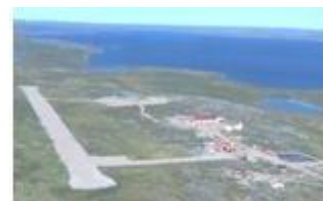
Airfield and Camp